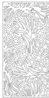
48" x 96"