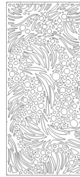
48" x 108"