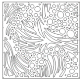
48" x 48"