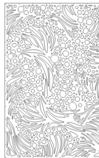
60" x 96"