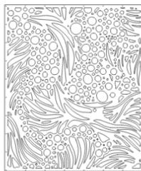
60" x 72"