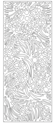
48" x 120"