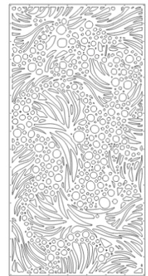
60" x 120"