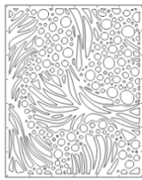
48" x 60"