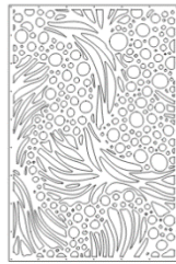
48" x 72"