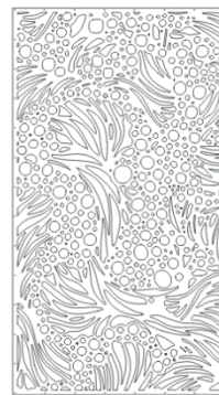
60" x 108"